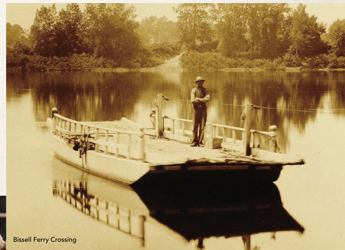
Bissell Ferry Crossing

Where history, nature, and the arts come alive.