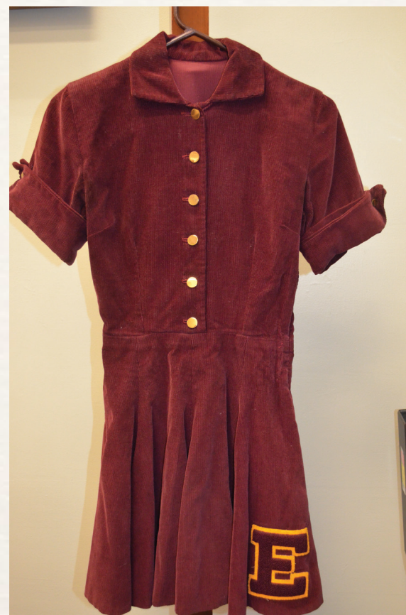
Ellsworth School Cheer Uniform

This past spring The Wood Collaborated with the South Windsor Public Schools to celebrate the shared history of East Windsor and South Windsor with an Open House at Ellsworth School. It was a resounding success. Over 350 people including many town officials visited the school to meet up with former classmates and share with their families and friends the wonderful memories they had of their time at Ellsworth School. Many attendees then decided to share their memories with our Oral History interviewers and now they can be shared with everyone as the latest contributions to our ongoing Oral Histories collection. Memorable moments at Ellsworth were shared, sweet and silly stories that had an impact on their lives along with musings about growing up on Main Street and road trips to athletic and academic events.