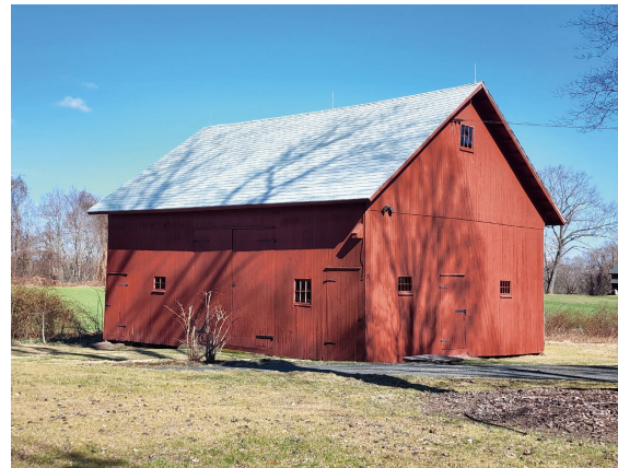
English Style Barn located at 809 Main Street

The Vibert property is located in the national Windsor Farms Historic District, and both the property's house and English style barn date to 1845. The barn is listed on Preservation Connecticut's Historic Barns of Connecticut and remains in its original three-bay state with a hay loft, center doors under each eave and milking stalls.